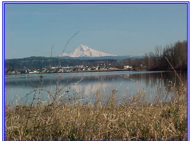
View of Mt. Hood from across Fairview Lake