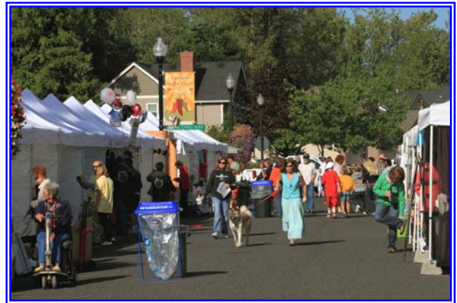
Fairview on the Green – Summer Festival