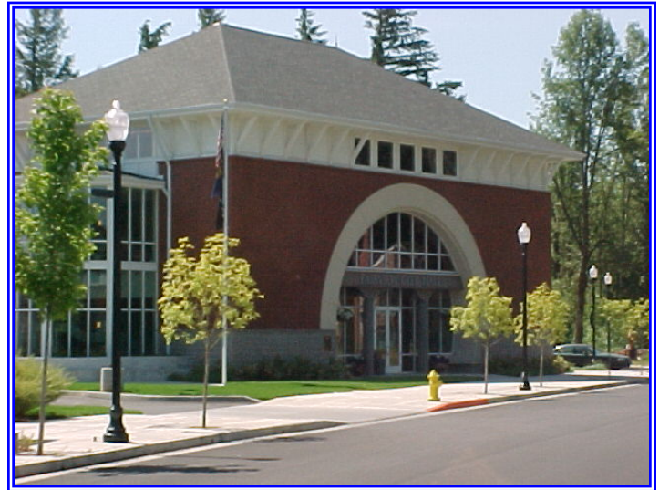
Fairview City Hall