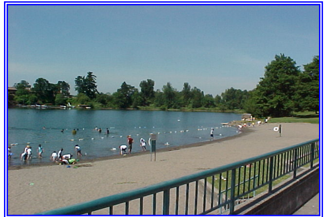
Blue Lake Regional Park