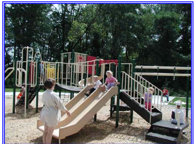
Fairview Community Park