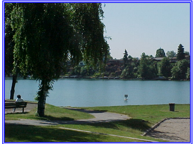
Blue Lake Regional Park