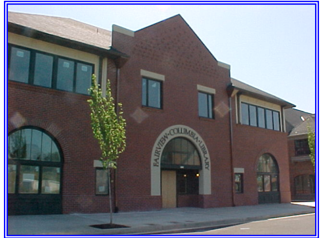
Fairview-Columbia Public Library

For more information visit our website at www.fairvieworegon.gov